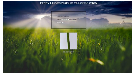
Figure 9.3. Webpage displaying Healthy Leaf