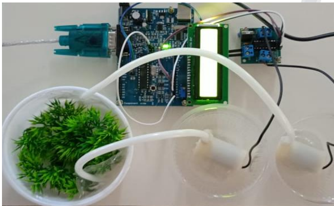
Figure 4. Hardware Circuit

To display paddy leaf disease information on an LCD, a circuit can be set up using a microcontroller, sensors, and an LCD module. The microcontroller, such as Arduino, is programmed to read data from the sensors that detect the presence of paddy leaf diseases. The sensor data is processed and analyzed using algorithms to determine the specific disease type. Once the disease is identified, the microcontroller sends the corresponding information to the LCD module for display. The LCD module is connected to the microcontroller through appropriate interface connections, such as GPIO pins. The microcontroller controls the LCD to show the disease name, severity level, or any other relevant information about the paddy leaf disease. The LCD provides a visual output that can be easily read and interpreted by farmers or experts, enabling them to take appropriate actions to manage the disease and protect the paddy crop. The complete circuit board and the LCD display Output is shown in the Figure 4.