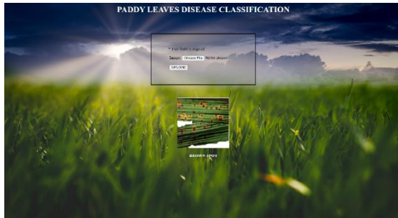
Figure 9.2 Webpage displaying the affected disease name