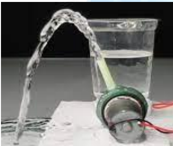
Figure 7. Pump Motor Water Ejection

If particular disease is affected by the crop, then the concerned motor pump is made to on and the water mixed with the respective curing chemicals, is made to pass to the crop for the treatment as shown in Figure 7.