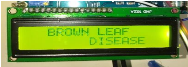
Figure 5. Disease Affected indication