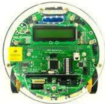
Fig.3 Fire Bird V

It contains Smart NiMH battery charger with power adaptor, Serial cable, SB cable, Flex printed 6 feet white lineUSB Programmer (ISP). Specifications of Fire bird V robot is Atmel ATMEGA2560 as Master microcontroller, Atmel ATMEGA8 as Slave microcontroller, 2 x 16 Characters LCD, Indicator LEDs, Buzzer, Eight analog IR proximity sensors, Three white line sensors