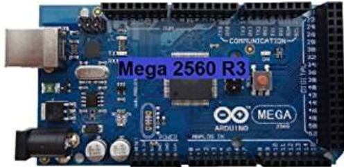
Fig. 2 ATMEGA 2560 Controller

operates between 4.5-5.5 volts. By executing powerful instructions in a single clock cycle, the device achieves a throughput approaching 1 MIPS per Hz balancing power consumption and processing speed.