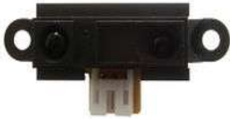
Fig. 4 Proximity sensor