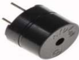
Fig. 6 Buzzer

A buzzer or beeper is an audio signaling device which may be mechanical, electromechanical, or piezoelectric. Typical uses of buzzers and beepers include alarm devices, timers, and confirmation of user input such as a mouse click or keystroke.