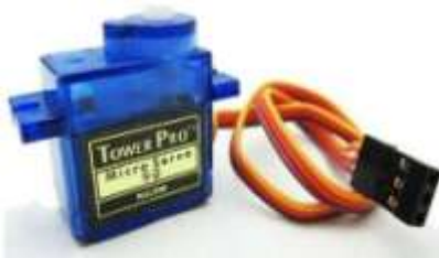
Fig. 5 Servo Motor

A servomotor is a rotary actuator or linear actuator that allows for precise control of angular or linear position, velocity and acceleration. It consists of a suitable motor coupled to a sensor for position feedback. It also requires a relatively sophisticated controller, often a dedicated module designed specifically for use with servomotors. Servomotors are not a specific class of motor although the term servomotor is often used to refer to a motor suitable for use in a closed-loop system. Servomotors are used in applications such as robotics, CNC machinery or automated manufacturing.