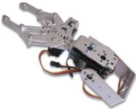
Fig. 7 Gripper

automation system. Many styles and sizes of grippers exist so that the correct model can be selected for the application. Compressed air is supplied to the cylinder of the gripper body forcing the piston up and down, which through a mechanical linkage, forces the gripper jaws open and closed. There are 3 primary motions of the gripper jaws; parallel, angular and toggle. These operating principals refer to the motion of the gripper jaws in relation to the gripper body.