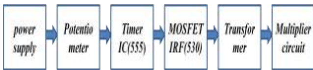
Fig 1: Block diagram of the given system

When supply is given now the timer produce oscillation then MOSFET triggered then transformer produce output this output given to multiplier circuit this circuit doubled the given output